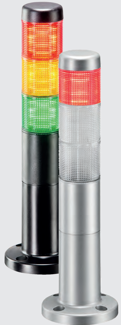
Size comparison KOMPAKT 37 / KombiSIGN 40