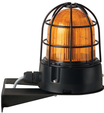
Mounting bracket (accessory)