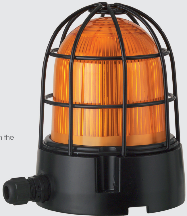
Size comparison EvoSIGNAL Midi/EvoSIGNAL Maxi/Heavy Duty