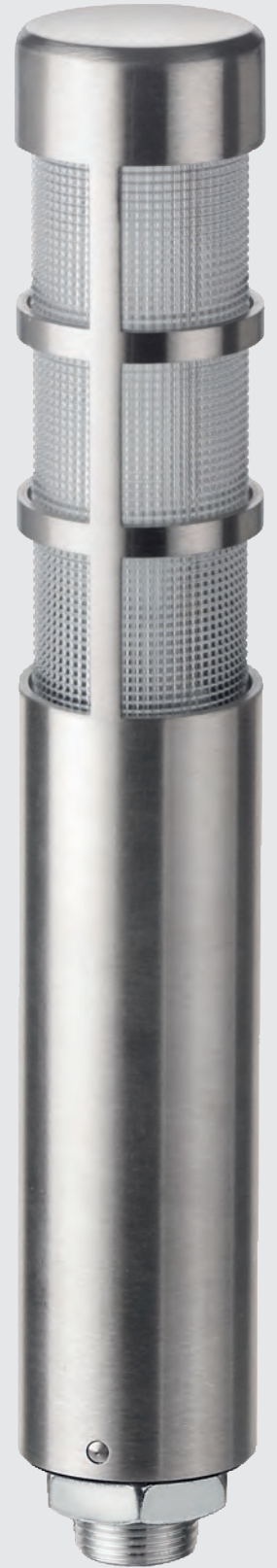
Size comparison deSIGN 42 / KombiSIGN 72