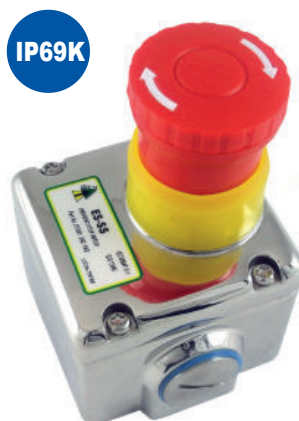
TYPE: ES-SS Stainless Steel 316