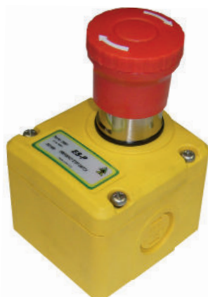
TYPE: ES-P (Plastic) Knock out for plastic version