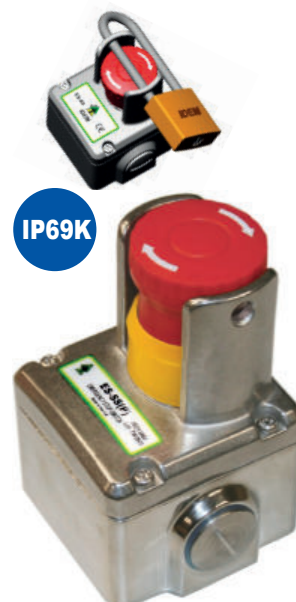
TYPE: ES-SS(P) Stainless Steel 316 with button protection shroud and padlock holes